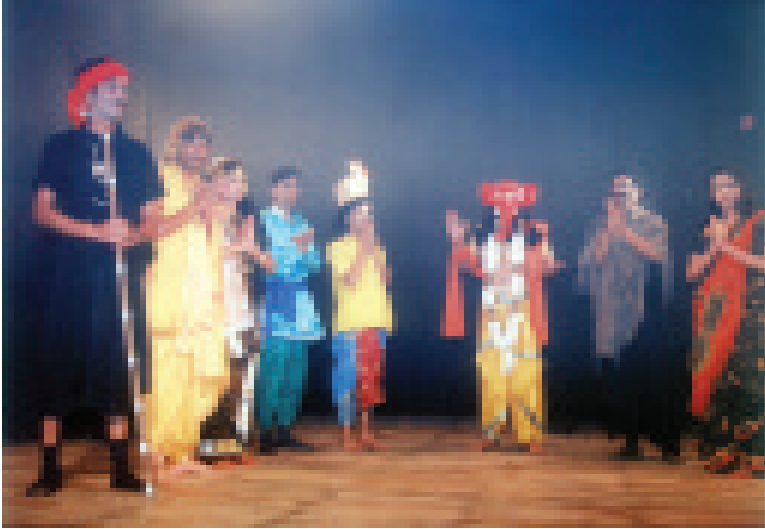
◀ 'Rajavaibhavam' by Shri Sadashiv Campus, Puri.