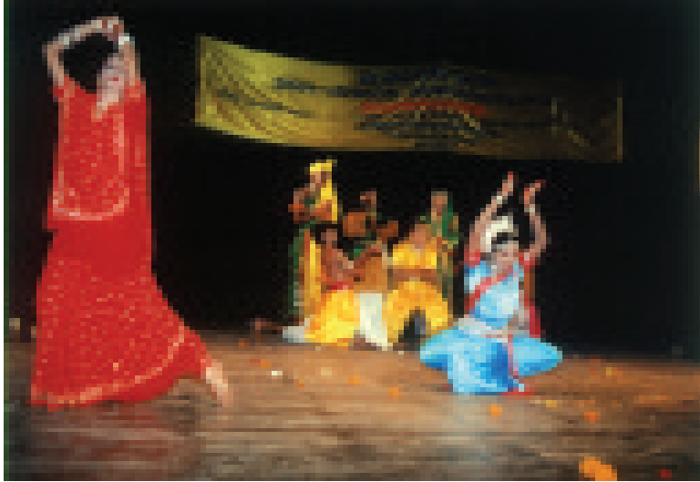
◀ Purva Ranga-by the students of Campuses