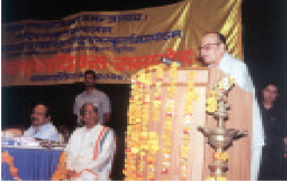
Hon'ble Minister of HRD Shri Arjun Singh ji addressing on the occasion of Sanskrit Diwas Samaroha