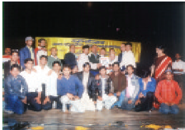
➤ Faculty member of Bhopal Campus receiving third prize for the drama performed by Bhopal Campus.