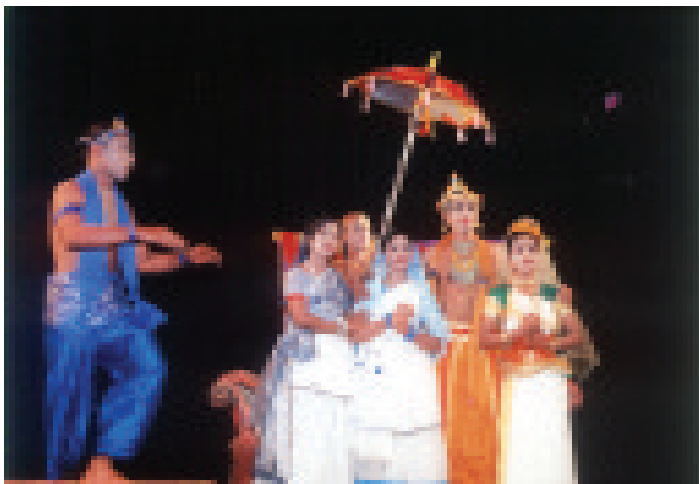
◀ Swapnavasavadattam by Guruvayoor Campus, Guruvayoor.