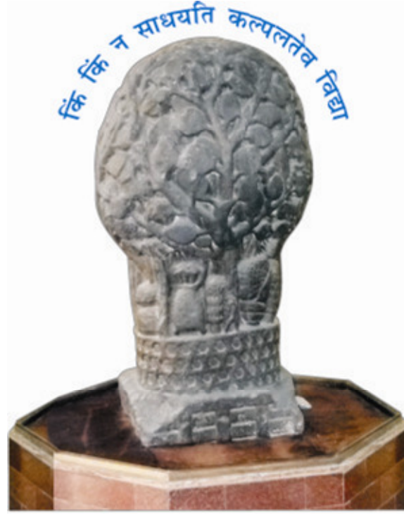
Kalpavṛkṣa; Vesanagar, 3rd Century B.C.E.

Jointly organized by International Association of Sanskrit Studies (IASS) and Rashtriya Sanskrit Sansthan (RSkS), New Delhi